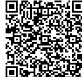
Houston Lost/Found Dogs, Pets