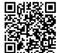
PETS OF OAK FOREST - Dogs and Cats - HOUSTON

Please be aware, there are scams across the internet where a scammer will pretend to have found your pet and “attempt to verify you are real” by sending a code to your phone. This is a scam. Do not send verification codes or login information to anyone claiming to have found your pet. Also meet in public places and bring a friend or family member with you if possible.