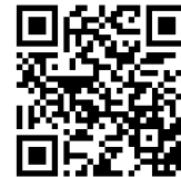
Texas – Lost Dogs, Cats & Pets – PawBoost Community