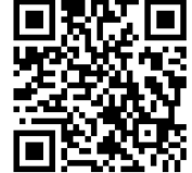
Lost N' Found Pets of Houston and Surrounding Areas