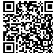
Houston Save-a-Pet and Pet Support