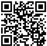
Lost and Found Pets: Houston & Surrounding Areas